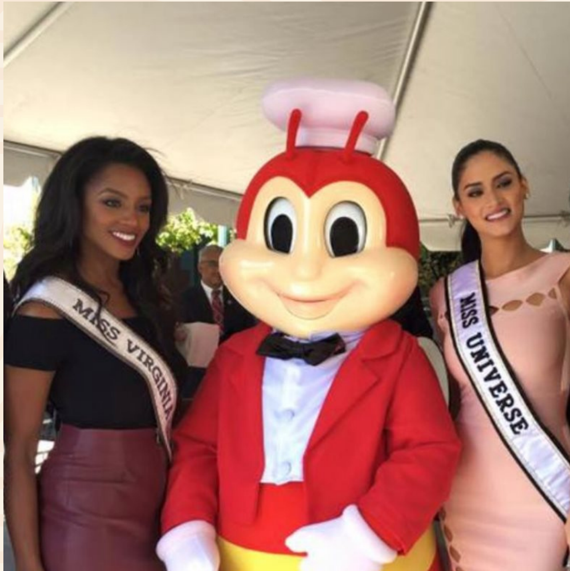
PIA WURTZBACH MISS UNIVERSE FILFEST 2016